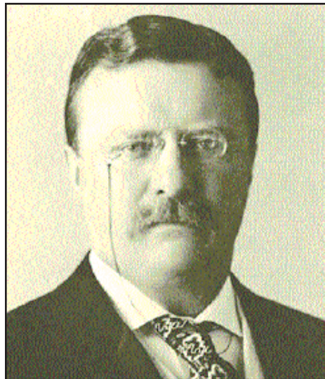
Theodore Roosevelt's ideas on Immigrants and being an AMERICAN in 1907.

'In the first place, we should insist that if the immigrant who comes here in good faith becomes an American and assimilates himself to us, he shall be treated on an exact equality with everyone else, for it is an outrage to discriminate against any such man because of creed, or birthplace, or origin.